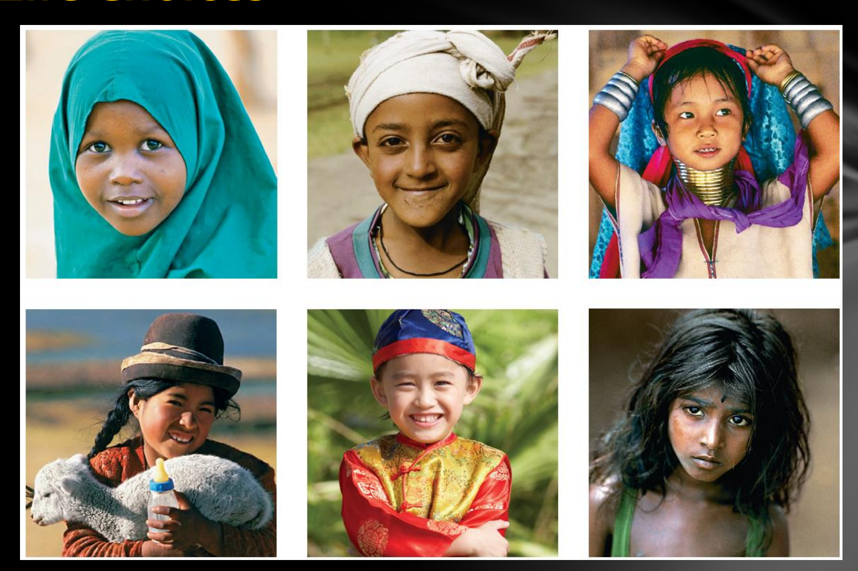
Kenya, Ethiopia, Myanmar, Peru, South Korea, and India